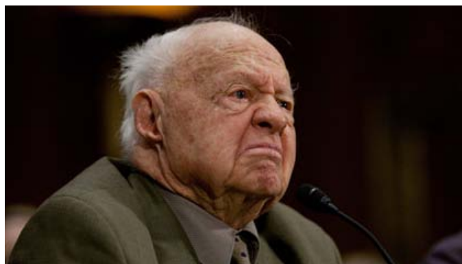
Mickey Rooney testifies before the Senate Special Committee on Aging.

Enlarge | Print | Comments (43) | Email | Recommend (10) | Tweet 27 | Like Confirm