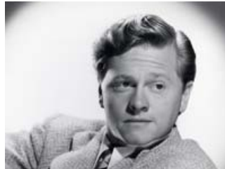
Mickey Rooney in 1944.

Rooney made his first cinematic appearance in 1926 as a child actor in the silent film Not to Be Trusted . He was later signed by the MGM studio and became one of Hollywood's biggest box-office draws in such films as Boys Town and Babes in Arms . In 1979, he revived his career with a stage production of Sugar Babies .