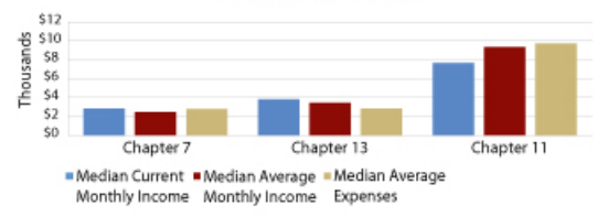
Income and Expenses of Filers with Non-business Debt Calendar Year 2009