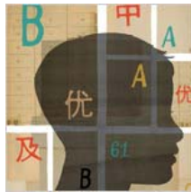
Testing, the Chinese Way