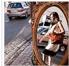
Lost in Tangier