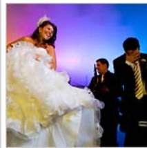
Weddings and Celebrations