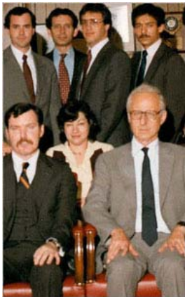
Sonia Sotomayor, seated behind Robert M. Morgenthau, right, in an undated photo.

Her Senate questionnaire lists dozens of her awards and honors, her letters to the editor of her college newspaper, her speeches and cases she handled as a prosecutor, a lawyer in private practice and, for the last 17 years, as a federal judge.