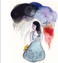
Op-Ed: My 9 Years as a Middle-Eastern American