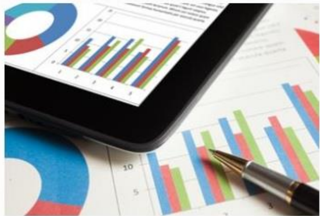
Analysis & Reports >

This section of uscourts.gov provides statistical data and analysis on the business of the federal Judiciary. Specific publications address the work of the appellate, district, and bankruptcy courts; the probation and pretrial services systems; and other components of the U.S. courts.