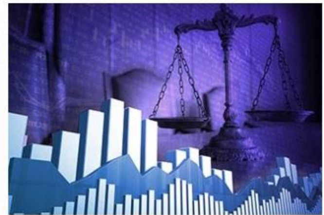
Caseload Statistics Data Tables >