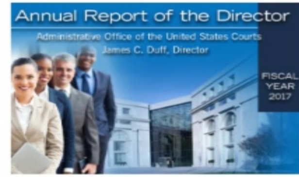
Annual Report 2017