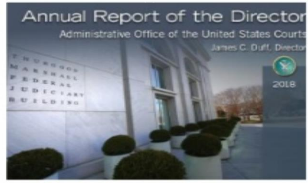
Annual Report 2018